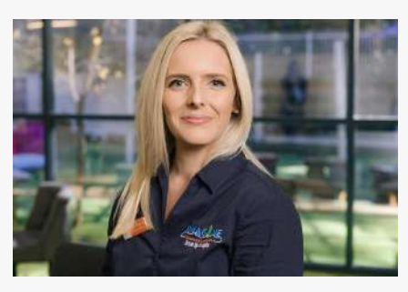
Get access to ongoing support services and mentoring