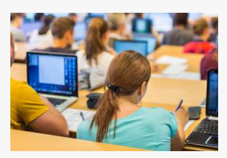
Create a stepping stone opportunity to higher education