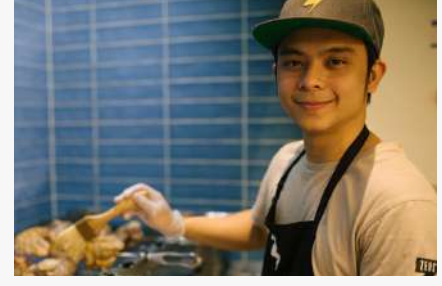
Get paid to work, while learning relevant on-the-job skills